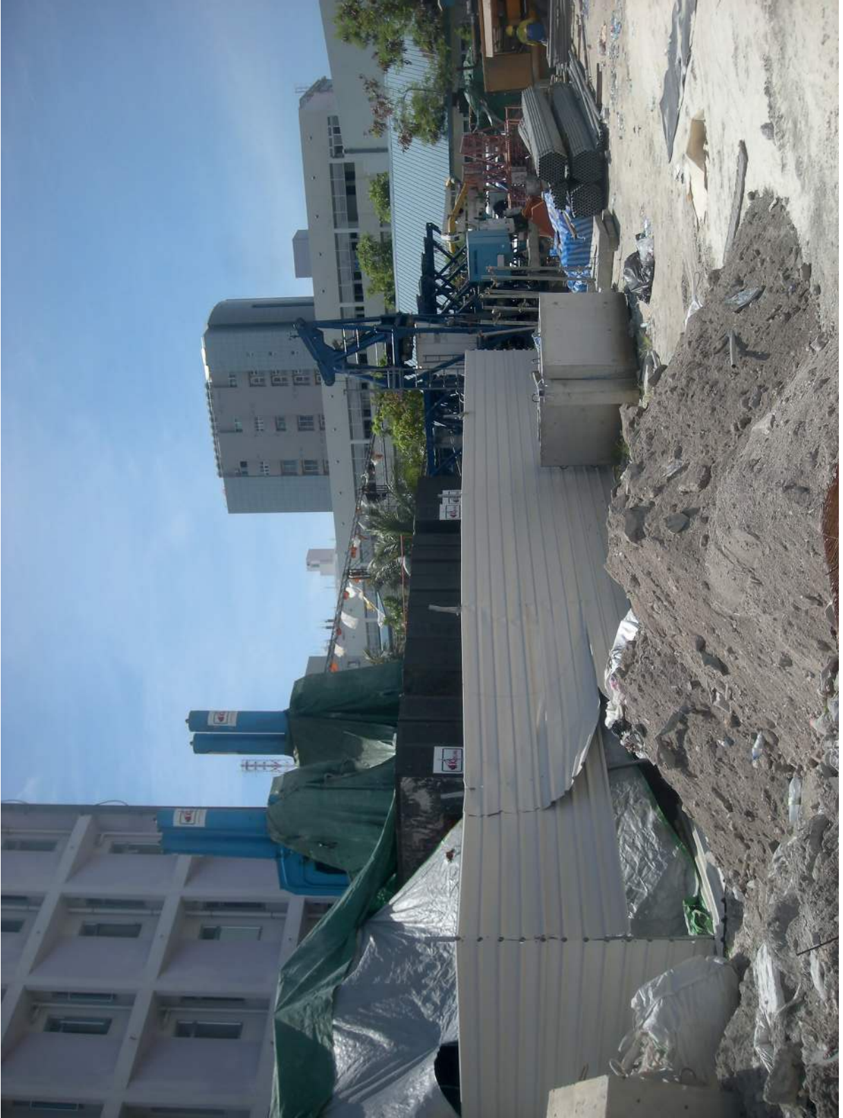
Fig. 2.2 for Question 2